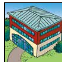
At your office ...

LIVE AND ARCHIVED INTERNET ATTENDANCE Watch the conference in live streaming video over the Internet and at your convenience at any time 24/7 for six months following the event.