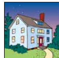
... or home

PROS: Live digital feed and 24/7 Internet access for the next six months; accessible in the office, at home or anywhere worldwide with Internet access; avoid travel expense and hassle; no time away from the office.